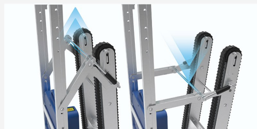
Folding in Dual Mode