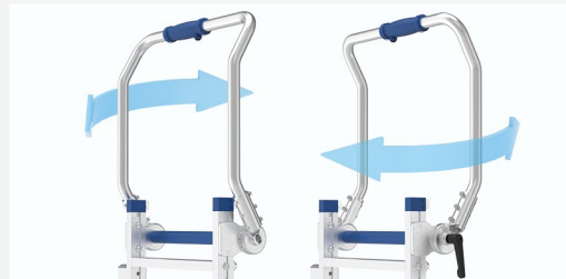
Front and back installation

Folding portable body, space-saving storage.