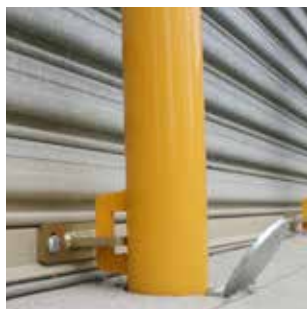
① Roller door bracket