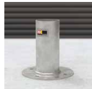
⑥ Surface mount holder