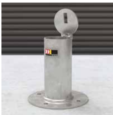
6 Surface mount holder