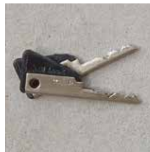
⑦ Additional keys