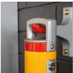
⑤ Hanging holder

Note: All dimensions in mm. Finish: Hot Dip Galvanised (HDG) only/and Powder Coated (PC), or 316 Stainless Steel (SS) only/and Aluminium cap with handle (H). *Each order of one or more bollards is supplied with TWO keys. **Additional keys are available to purchase separately.