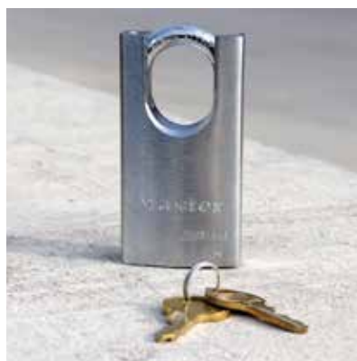
7 Shielded padlock