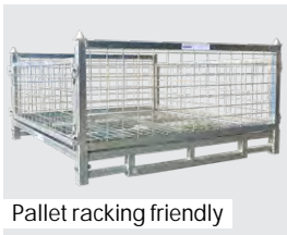
Pallet racking friendly