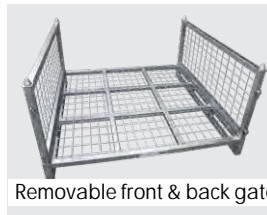
Removable front & back gate