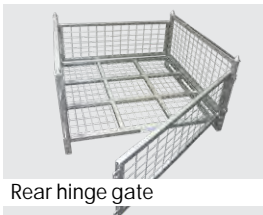
Rear hinge gate