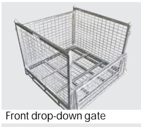
Front drop-down gate