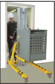
Fits through doorways!