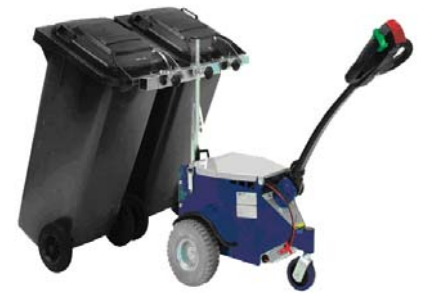
M3 + Sulo Bin Attachment