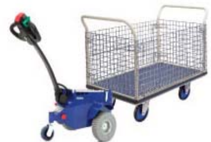
M3 + PRESTAR

It is equipped with non-marking tyres and gel batteries to reduce maintenance. All Zallys tugs are produced with quality in mind and are CE certified.