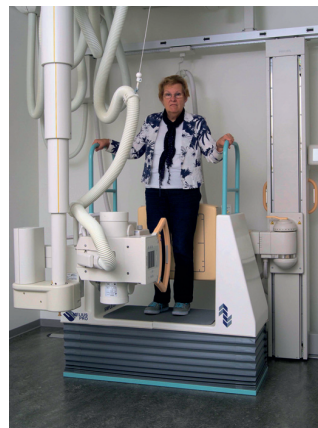
Ease of work