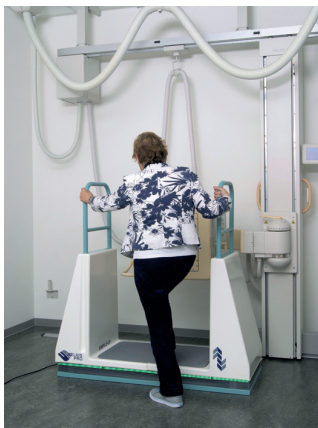
Easy step up

The Simple Up allows you to lift your patient without steps. The machine easily raises the patient safely to the best height for medical applications, like x-raying lower limbs. With a very low step height, it helps to prevent patient falls. The Simple Up is ideal for patients who have restricted movements, as it ensures flexible positioning and improves ergonomics for staff.