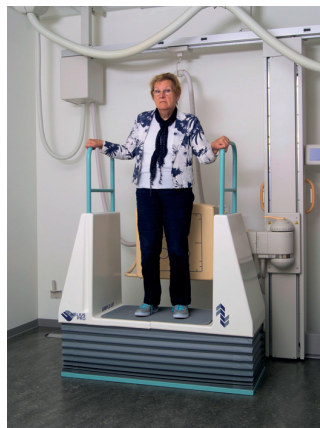
Sufficient space and robust hand rails