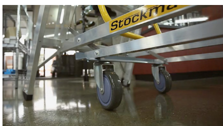
Navigator keeps all four feet firmly on the ground unless you're moving it.