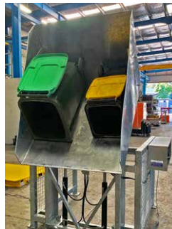
Wheel guides retain bin