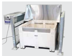
Optional Stainless inserts (on request)