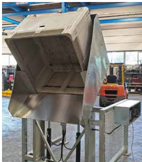
Bin retainers fitted for mega bins