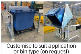
Customise to suit application or bin type (on request)