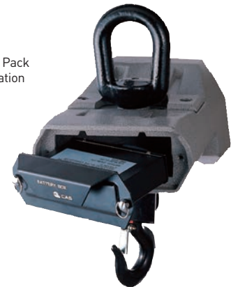
Battery Pack Installation