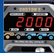
1.2" LED display