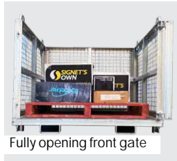
Fully opening front gate