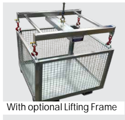
With optional Lifting Frame