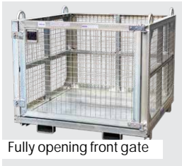
Fully opening front gate