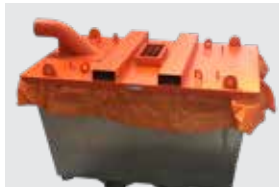
Type MCPC17 with Plastic Liner