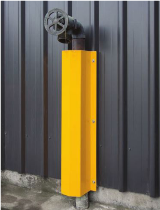
BDP100 Bull-dog Downpipe Protector For downpipes up to 100 mm diameter