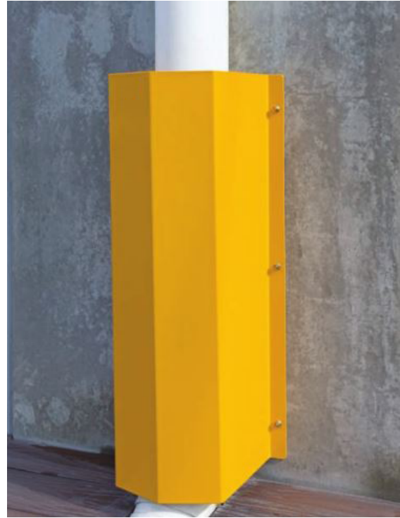
BDP200 Bull-dog Downpipe Protector For downpipes up to 200 mm diameter