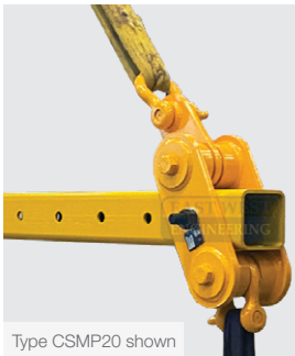
Type CSMP20 shown