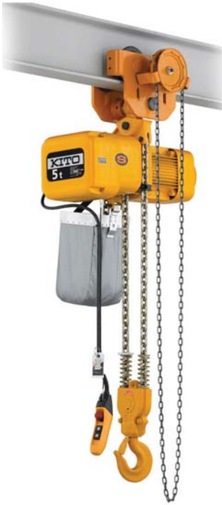
TSG for ER2 electric chain hoist with connector E