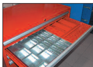
Heavy duty steel division trays