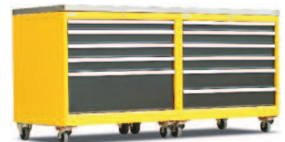
Twin mobile cabinets with a stainless worktop