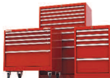
Mobile and static versions available in your choice of colours