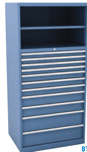
Code BTCS.2100.1010 combination cabinet