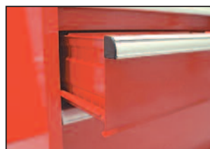
Drawer pull bar with lock tab