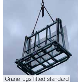
Base sized to optimise space

SAFT80 SAFT115 Working Load Limit 1500kg 2000kg Overall Dimensions* LxwxH 1500x800x1620mm 1800x1150x1620mm Maximum Load Width** 215mm 340mm Unit Weight 105kg 130kg Fork Pocket Size 250 x 80mm 250 x 80mm Fork Pocket Centres 450mm 450mm