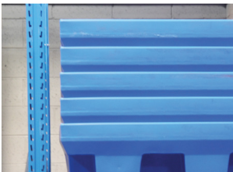
Nestable for transport