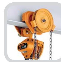
TSG geared trolley 500kg – 10T