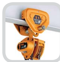
TSP plain trolley 500kg – 5T