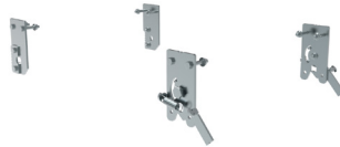
Standard fitting kit A405.700