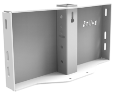
Adjustable connection A151.820