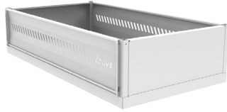
Platform 800x1500xh300 mm A033.700