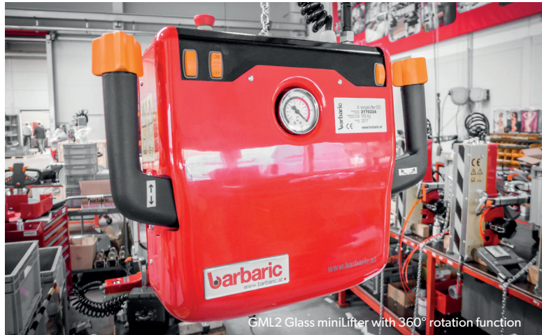
GML2 Glass miniLifter with 360° rotation function