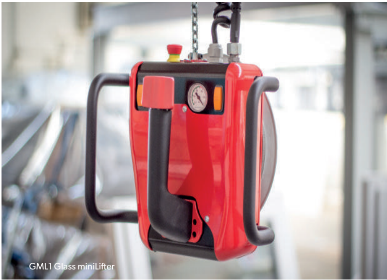
GML1 Glass miniLifter

Unique handling solution for quick manipulation of parts with flat surfaces.