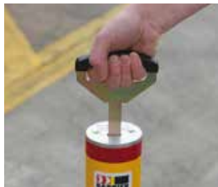
③ 'T' handle key