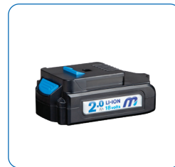
BPB-20AH 18V 2.0Ah Li-ion battery