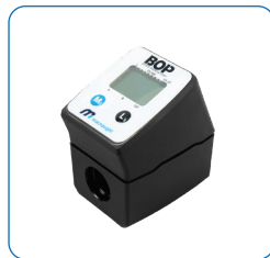
IM012EB-01 BOP inline meter