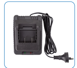
BPC-A BOP Charger