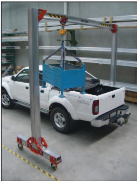
Mobi-Trac Static gantry 1000kg MRC x 3metres wide with optional castors