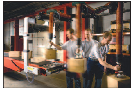
A special Vaculex ParcelLift™ option with carbon fibre jib for telescoping conveyors