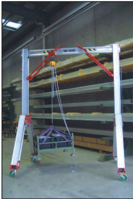
Mobi-Trac Dynamic gantry 1000kg MRC x 3metres wide shown at highest position with optional castors