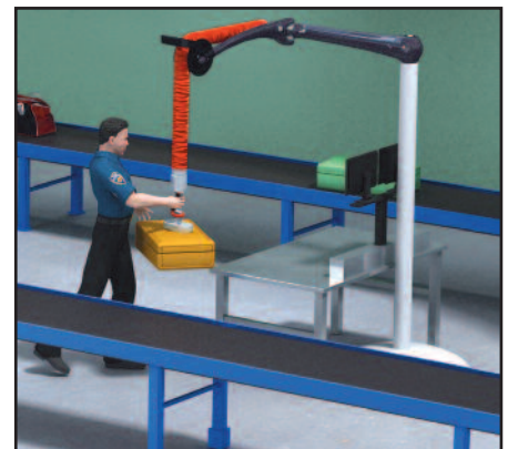
Simulated pillar mounted carbon fibre jib picking product with our Vaculex TP vacuum tube lifter

Our Swedish partner, Vaculex has produced a spectacular carbon fibre articulated jib arm that weighs only 8kg. By combining this arm with our Vaculex vacuum tube lifters we can provide a fast, gentle & safe lifting unit for freight, goods, mail, baggage etc. The minimal weight of the jib arm makes the lifting task easier & faster because there is hardly any resistance when moving loads up to 40kg. They can be fitted to, freestanding columns, X-Y gantries & with our ParcelLift™ version, the end of telescopic conveyors.