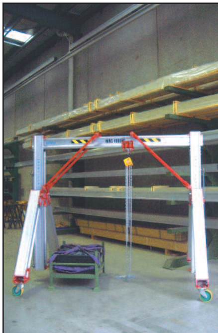
Mobi-Trac Dynamic gantry 1000kg MRC x 3metres wide shown at lowest position with optional castors