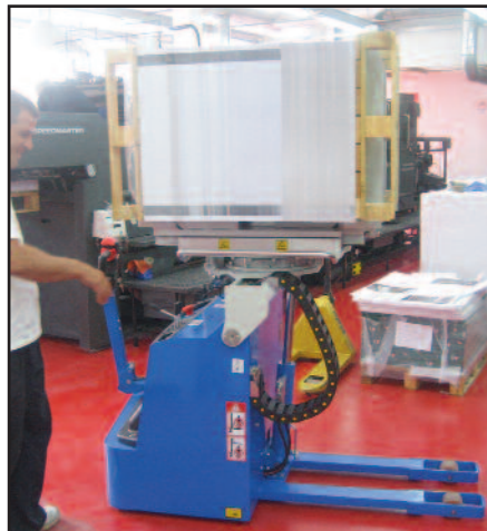
When the Argo M10A is fully tilted back the load is then rotated 180 degrees & lowered. The top exchange pallet is now at the bottom of the load

The 1000kg capacity Pharma machine is specific for the pharmaceutical, food & other industries for moving boxes, drums, sacks & loose items. The machine has 3 security mobile grills and has two laterals to avoid falling when moving material, one is fixed in 2 forks, and covered with a soft material for fragile material.