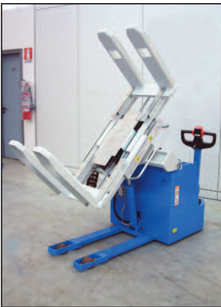
Argo M10A with 700mm forks for single faced pallets/skids

In the printing industry, the 1000kg capacity Argo & the Aries 1600kg capacity, are designed to handle large loads invert pallets in less than a minute without compressing them, allowing maximum continuity in any production process. They turn stacks of paper without exerting pressure, gently handling freshly printed sheets & delivering them directly to printing machines. They can also be used in other industries. The Argo is also available with an optional Air Jogger that is the perfect partner in the printing equipment as it efficiently jogs paper stacks and reduces static electricity in paper sheet stacks & levels the sides of packs.