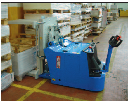
Aries M16A retrieving stock