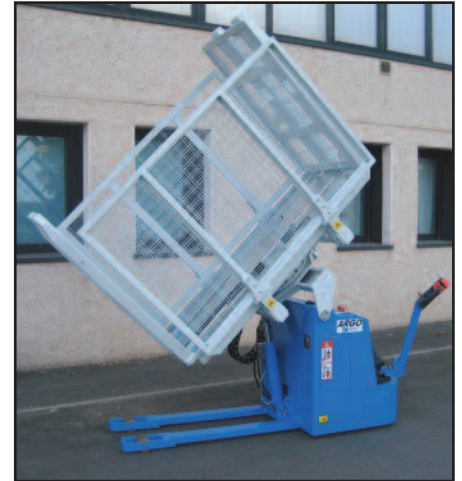
The Pharma has enclosures to contain loose items

The 1000kg capacity Pharma machine is specific for the pharmaceutical, food & other industries for moving boxes, drums, sacks & loose items. The machine has 3 security mobile grills and has two laterals to avoid falling when moving material, one is fixed in 2 forks, and covered with a soft material for fragile material.