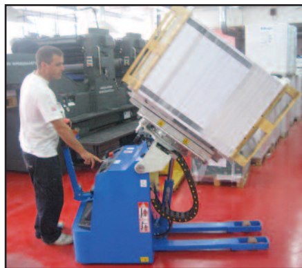
Before the Argo M10A is lifted the exchange pallet is placed on top of the load