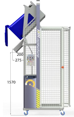
DM1800 with 200mm chute & 120L bin