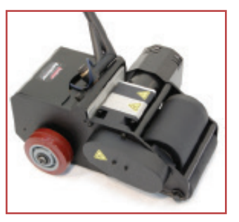
Heavy Duty TruckMover™