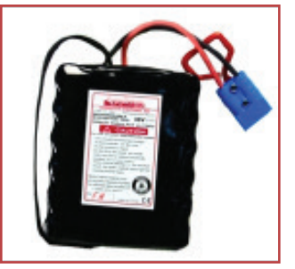
Specially Designed Battery & Charger for top performance