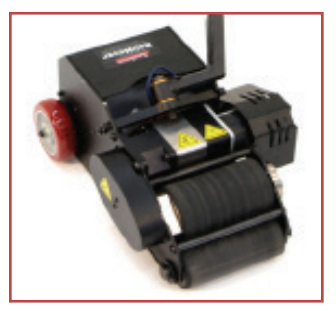
Standard Duty TruckMover™