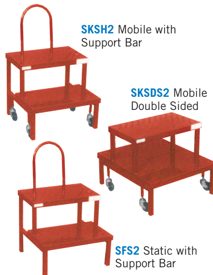
SKSH2 Mobile with Support Bar

Strong mild steel construction with non-slip grip steps - 485mm wide x 500mm deep x 380mm high with sprung castors.