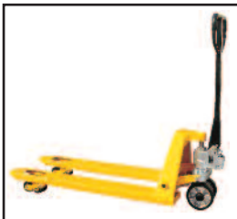
Code M20SLQ Quick Lift