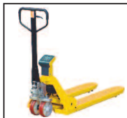
Code M20LWP Weigher with Printer