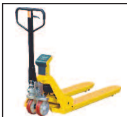
Code M20LW Weigher