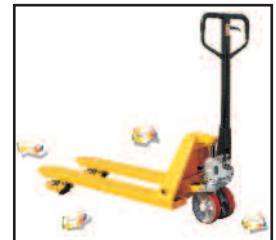
Code M20L2 Two Way