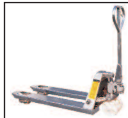
Code M20LHG Galvanised