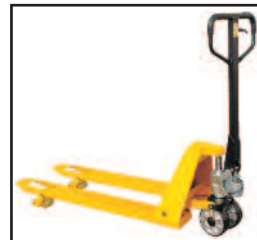
Code M20LB Low