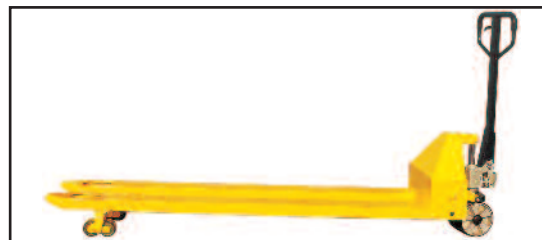
Special width or length